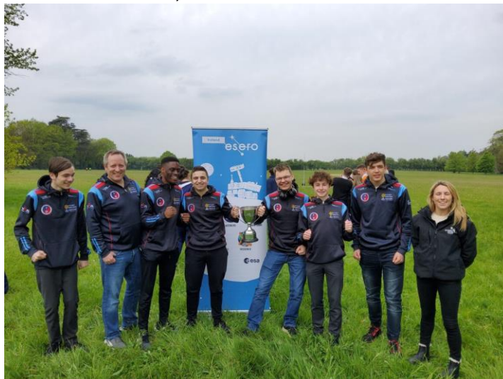
Coláiste Chiaráin (Limerick), winner of CanSat Ireland 2023