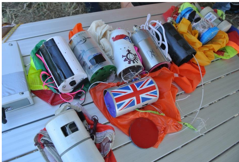
A selection of CanSats with their accompanying parachutes from a European CanSat Final