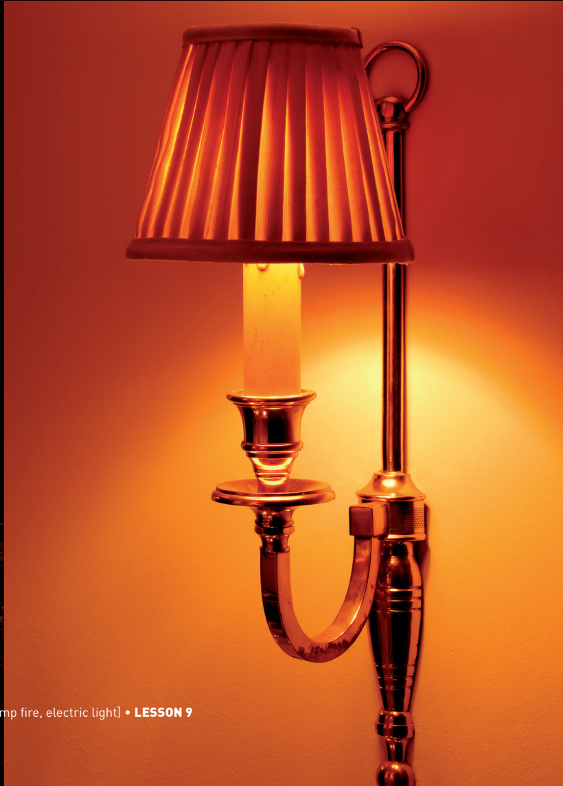
Sources of light [Sun, lightning, camp fire, electric light] • LESSON 9